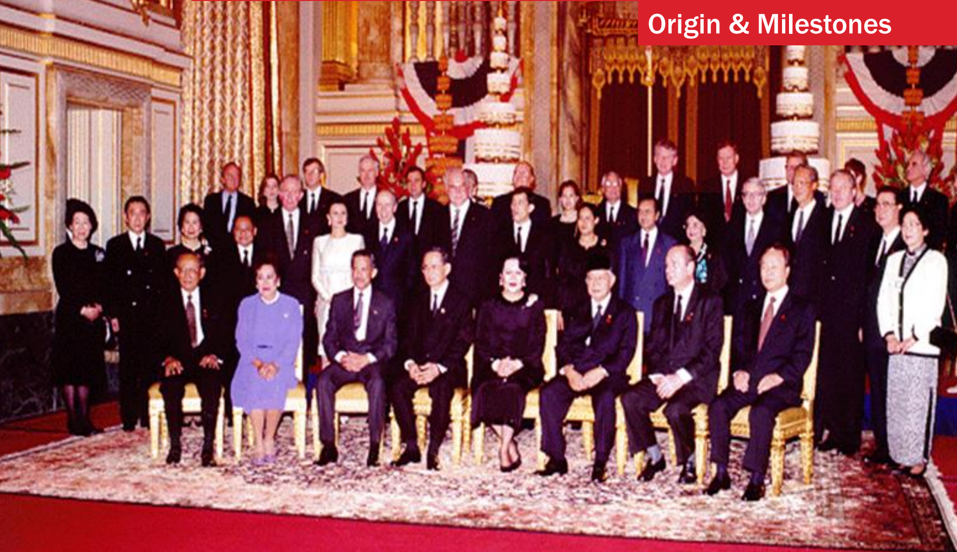
1 st ASEM Summit (ASEM1), March 1996, Bangkok, Thailand